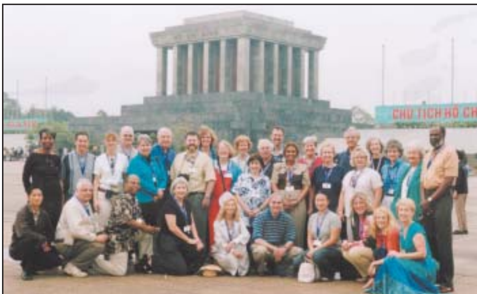
Delegation visits Ho Chi Minh's Mausoleum, Hanoi.